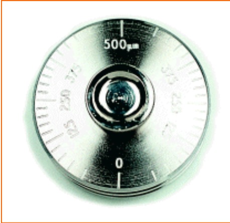
Elcometer 3230 Wet Film Wheels