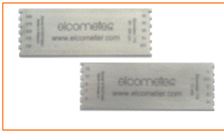
Elcometer 115 Wet Film Combs

These reusable precision stainless steel combs are made to be long lasting and are supplied with either Metric or Imperial measurements.