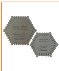
Elcometer 112 & 3236

These stainless steel combs are wire eroded to provide an accuracy of \pm 2.5\mu\text{m} (0.01mil) and are supplied with either Metric or Imperial measurements.