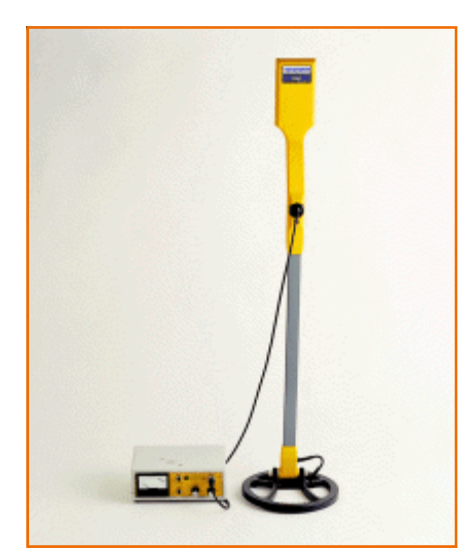
Elcometer P520 Deep Cover Metal Detector