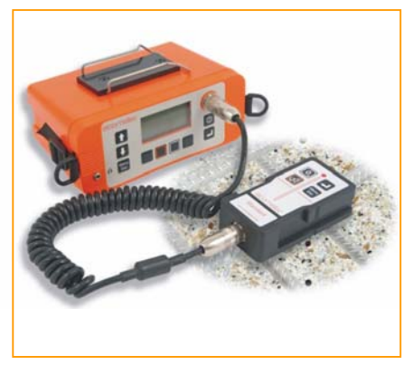
Elcometer 331<sup>2</sup> Covermeter with Stainless steel and Half-Cell