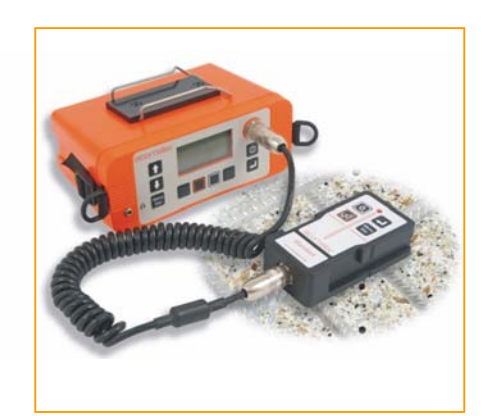
Elcometer 3312 Covermeter with Half-Cell