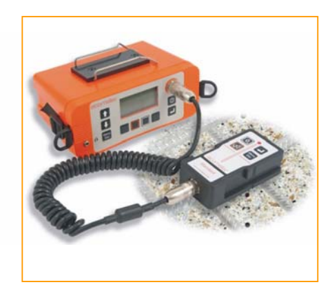
Elcometer 3312 Covermeter with Half-Cell