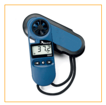
Elcometer 410 Anemometer