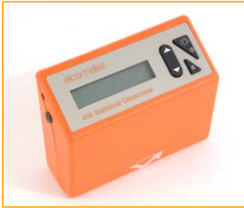
Elcometer 406L Statistical Mini Glossmeter